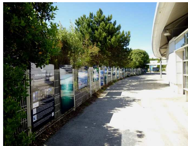
Présentation de l'exposition à Océanopolis, Brest, du 5 juin au 31 août.

Climate change also strongly impacts the oceans, species living there, as well as coastlines that are subject to an important increase of risks.